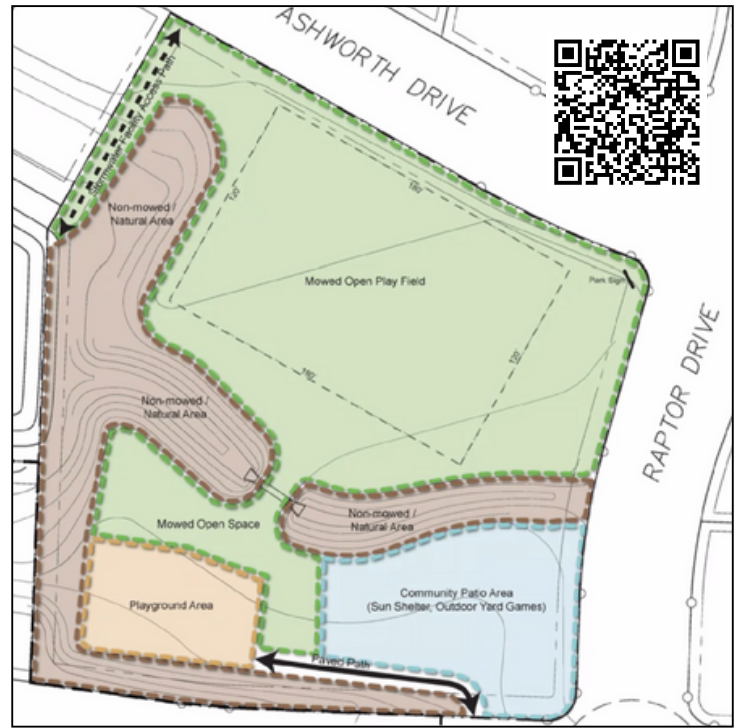
Draft Park Development Plan

FOR KESTREL PARK UPDATES, VISIT THE WEBSITE AT www.cityofmadison.com/parks/projects/kestrel-park-development-plan